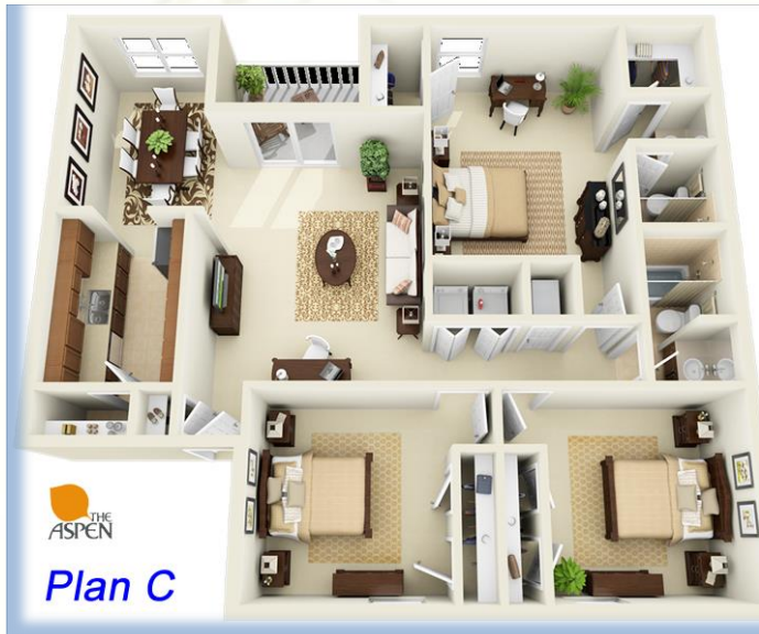
Three Bdrm / Two Baths 1268 Sq. Ft.