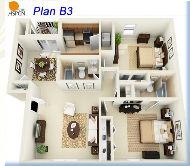
Two Bdrm / Two Baths 969 Sq. Ft.