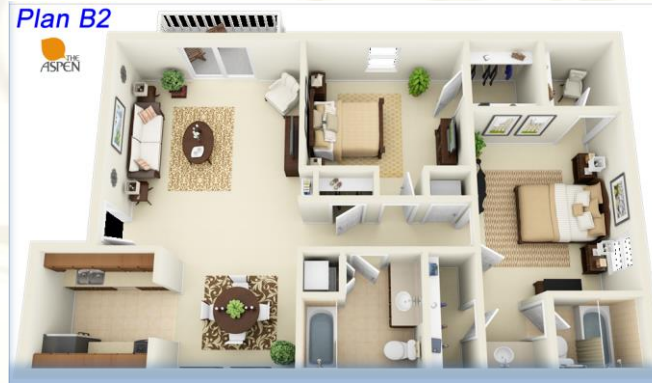
Two Bdrm / Two Baths 1026 Sq. Ft.